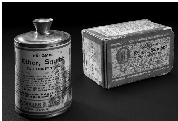
Figure 4. A metal bottle of ether.