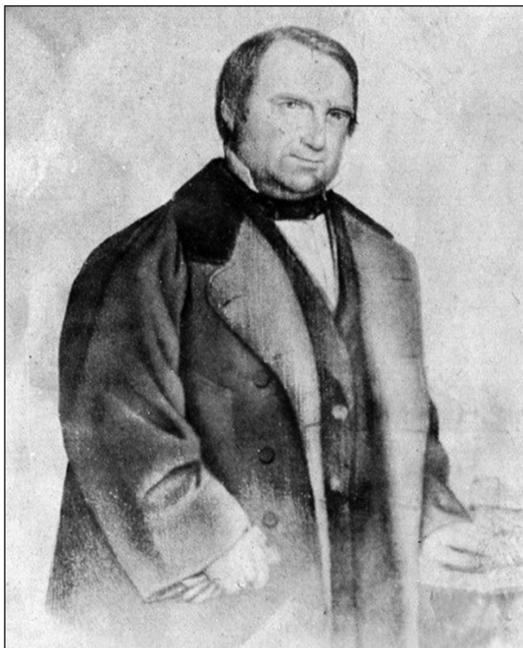
Figure 1. Professor Ludwik Bierkowski about 1850 (author unknown). Collections of the Chair of History of Medicine

Dieffenbach in Germany, not to mention many others, tested the possibilities of general anaesthesia, outlining new trends in practical medicine [2, 3]. Ludwik Bierkowski, a Polish surgeon, was also among the pioneers (Fig. 1).