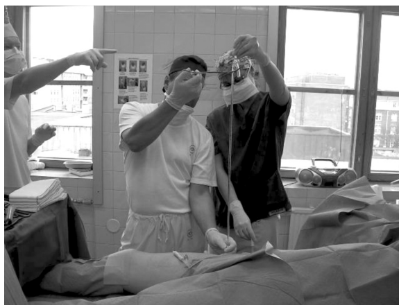
Figure 4. Measuring intra-abdominal pressure

The first damage control maneuver described in the literature was the packing of the liver to control bleeding from hepatic lacerations. Pringle in 1908 and Halsted in 1913 published the earliest descriptions of perihepatic packing for liver injury with severe bleeding [8, 9]. These observations were forgotten for several decades, until Stone and his co-workers published a series of 17 severely injured patients treated with abbreviated laparotomy and planned reoperation with a survival rate of 76% when compared with 14 similar patients undergoing definitive repair with only one survivor (7%) [10]. Damage control indications and techniques were refined by Ivatury in 1986 [11] and Burch in 1992 [12]. However, the term “damage control” — originat-