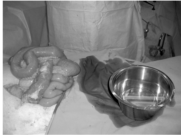
Figure 3. Peritoneal lavage

Peritonitis is defined according to both its cause and extent and is usually divided into primary, secondary and tertiary peritonitis [2]. In primary peritonitis, there is no iden-