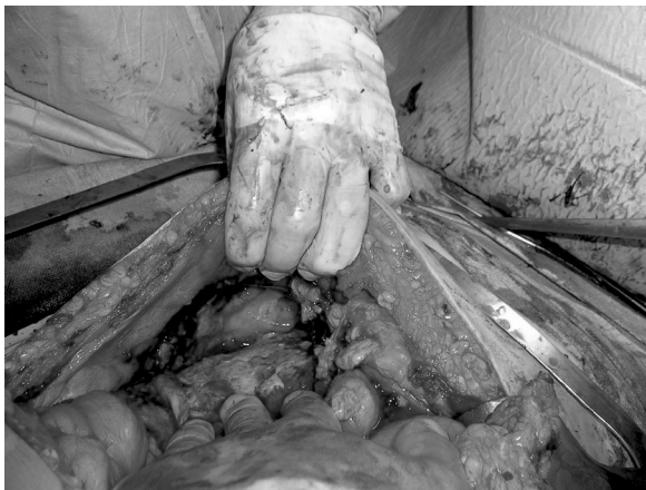
Figure 2. Operative photo of the same patient with subphrenic abscess

When systemic inflammatory response syndrome (SIRS) is due to infection, it is termed sepsis, and sepsis caused by an intra-abdominal infection (IAI) is termed abdominal sepsis. Sepsis with acute dysfunction of at least one organ is called severe sepsis, and severe sepsis with hemodynamic instability refractory to fluid administration, with a requirement for vasopressor support is termed septic shock [2].